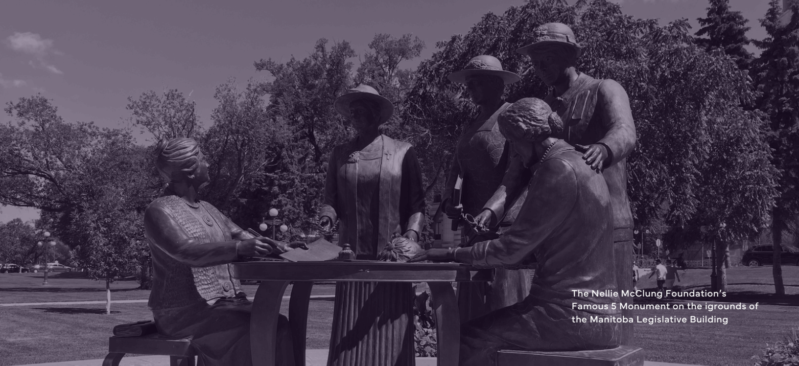
The Nellie McClung Foundation's Famous 5 Monument on the grounds of the Manitoba Legislative Building